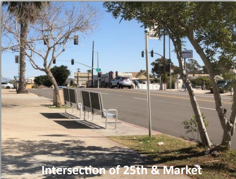
Intersection of 25th & Market