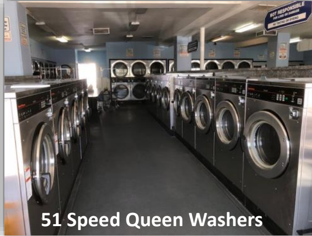
51 Speed Queen Washers