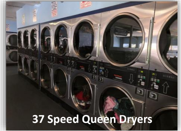
37 Speed Queen Dryers