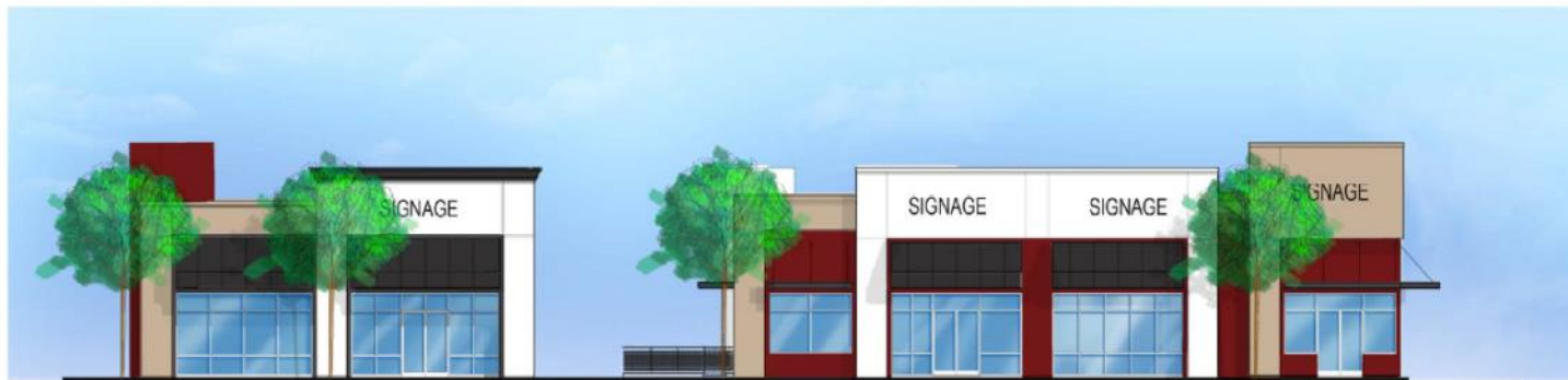
PARKING LOT ELEVATION