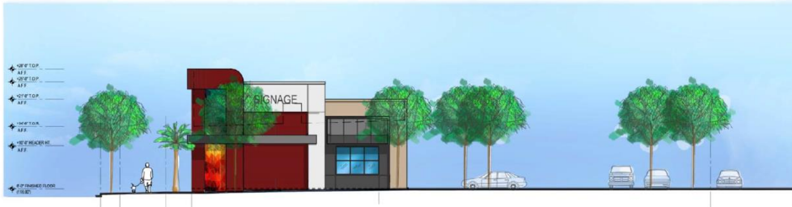
NARANJA STREET ELEVATION