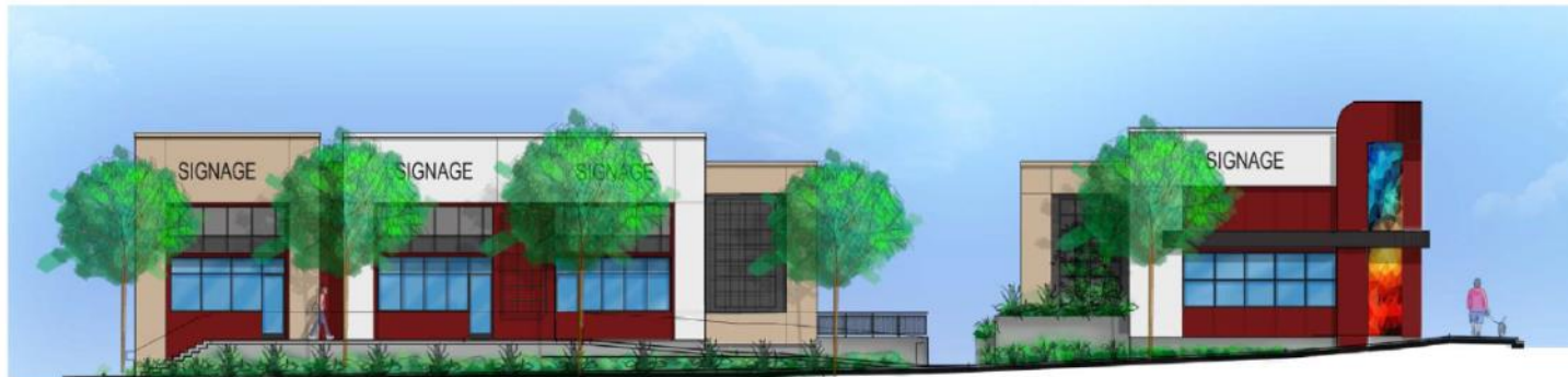
EUCLID AVENUE ELEVATION